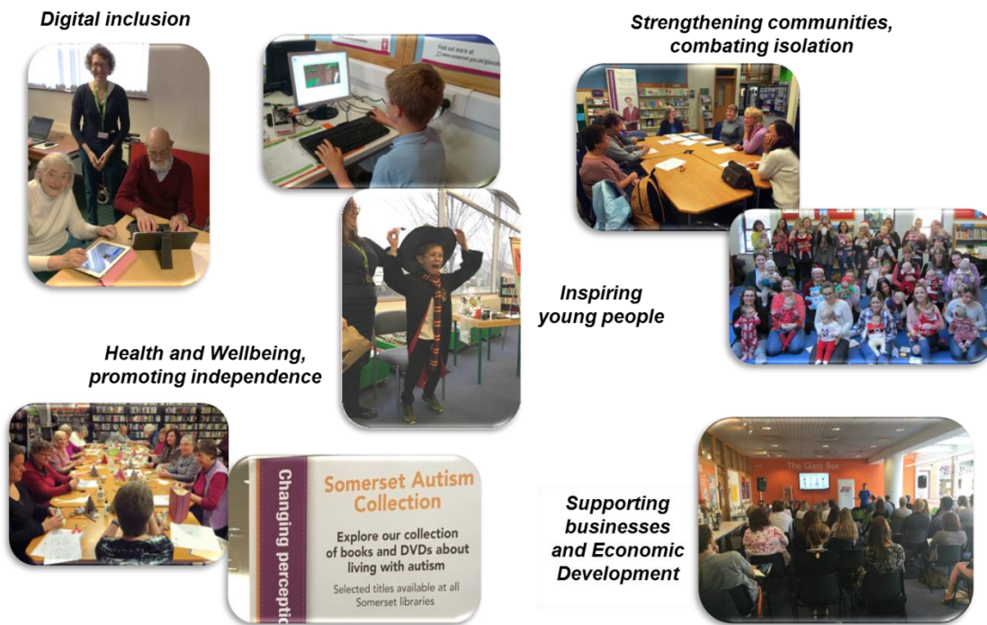
Fig. 1: Somerset libraries deliver a range of outcomes:

Further information on how we are delivering the Somerset Outcomes framework can be found in a short video produced to showcase our achievements in 2016/17 – available at: